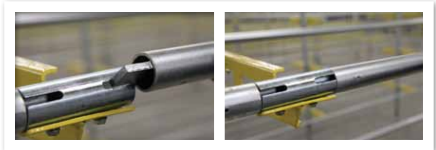
'Click and Twist' Mechanism