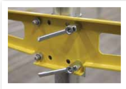
Friction Fit Clamps